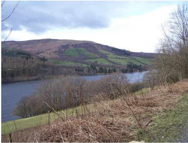
View from woodland path (lake is on your right)