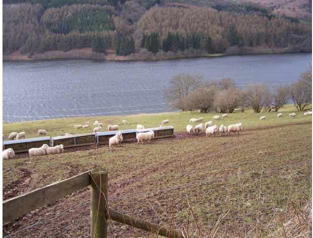
About to enter the farmland to continue around lake